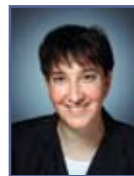
Lisa Najavits, PhD

Post-Traumatic Stress Disorder (PTSD) and substance dependence are closely interwoven. While it has long been recognized that addiction facilitates traumas, it is increasingly apparent that the pathophysiology of these two disorders is closely linked as well—with virtually all substances of abuse having important biological effects at multiple levels of the stress system (cortex, sub-cortex, and hypothalamic-pituitary-adrenal axis). Although the etiological relationship between PTSD and addiction has yet to be fully elucidated, clinicians must face the conundrum of managing these often unstable patients.